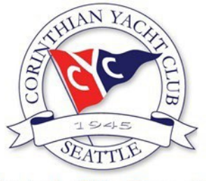
Sharing the Sailing Community